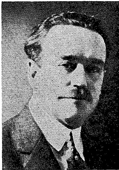
Rev. Chas. F. Parham

The words "if they have committed sins" signifies that in all probability sin was the cause of the sickness. The prayer of faith will save the sick, if coupled with the sincere prayers of the individual, but unless there is sincere repentance, the prayer of faith cannot prevail, for healing will not take place until the sin is forgiven. Such a case is illustrated in the healing of the man sick with the palsy (Luke 5). The elders indeed brought him and lowered him at the Saviour's feet. Jesus, seeing their faith and knowing the man's past, said: "Son thy sins be forgiven thee," and immediately he was healed. Forgiveness and healing must be concomitant.