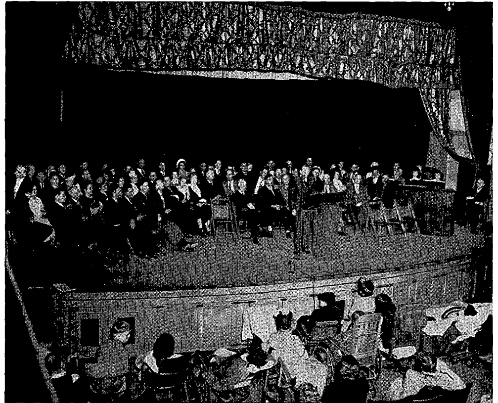
Branham campaigns provide a mutual meeting ground, for ministers of various organizations. This group of ministers photographed in Elgin, Ill., is typical.

We offer Christ's answer again. Peter has asked a question: "How oft shall I