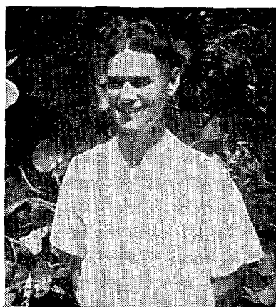
2768 N. W. 57 Street Miami 38, Florida Phone 7-0991 May 18, 1948

The Voice of Healing Box 4097 Shreveport, Louisiana