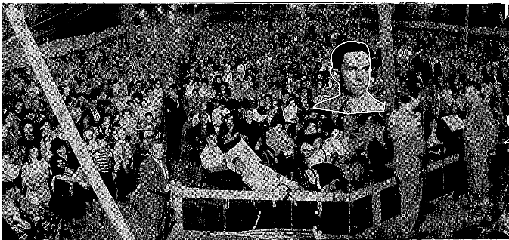
Osborn-Lindsay Healing Campaign in Reading, Pennsylvania. Some 3,000 were present on this Saturday night. On the following were 4,000 in attendance. About 3,000 responded to the altar call during these meetings, and many miracles took place. Insert above