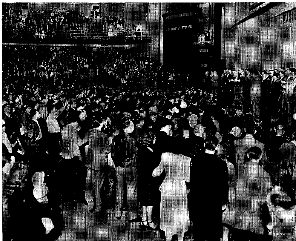
Altar Call at Kansas City, Kansas

There are numerous cases on record where people just prior to their passing