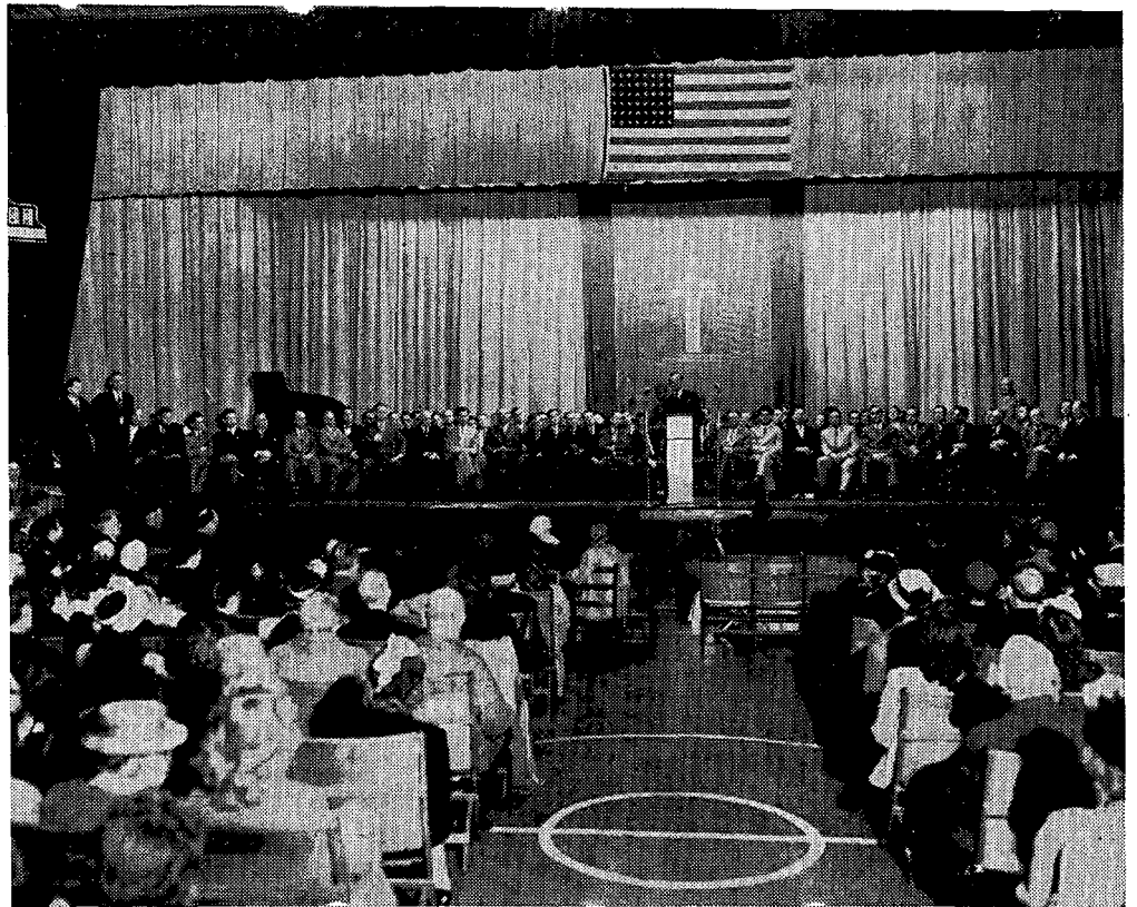
Nearly 100 Ministers were present at the Kansas City, Kansas, meeting on the night this picture was taken.