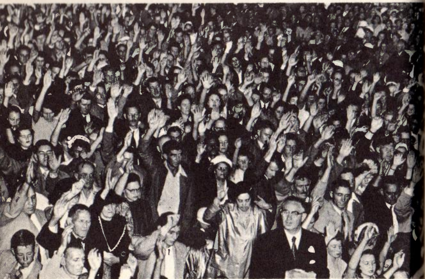
IN WEMBLEY STADIUM, Johannesburg. Part of 3,000 "whites" who came forward in one night to be saved. There were 21,400 saved in one week.