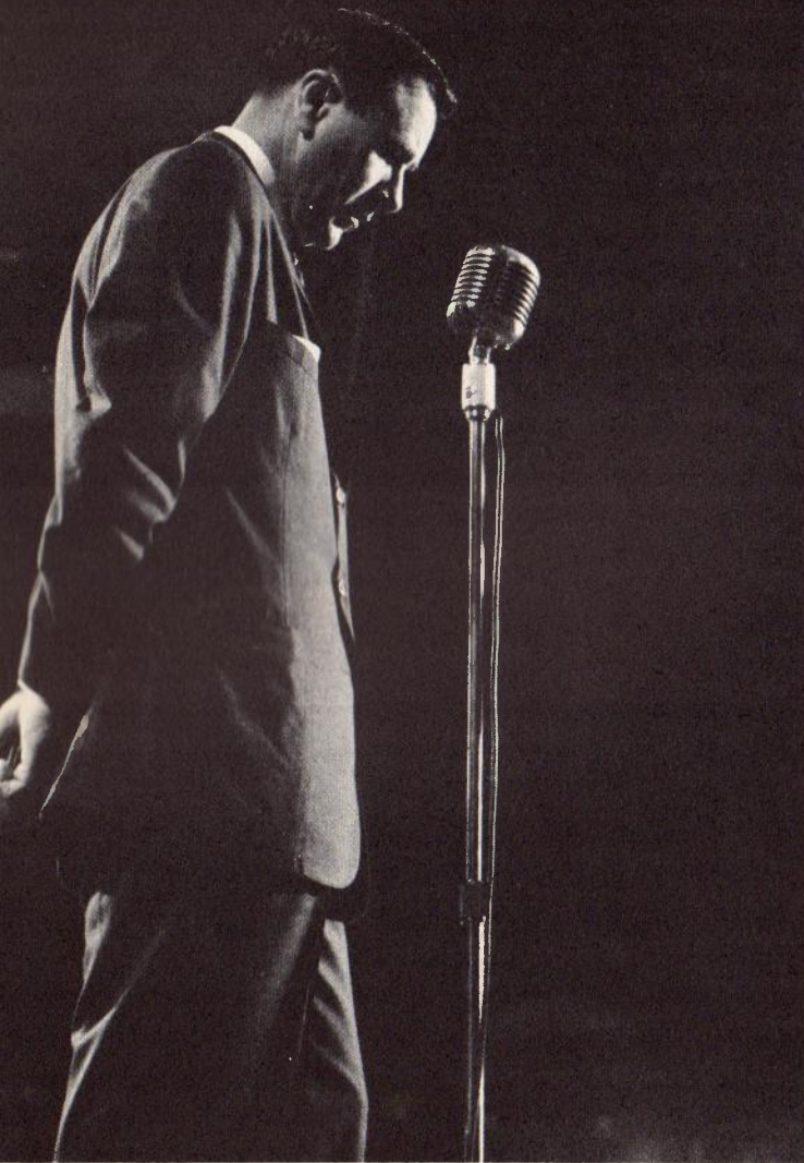
YOUR PARTNER FOR DELIVERANCE, AT PRAYER.