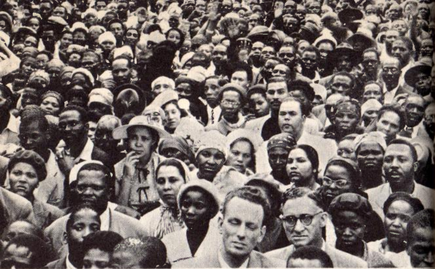
IN JOHANNESBURG. Throngs of "blacks" and "coloreds" stood under the trees to hear Oral Roberts and to receive his prayers.